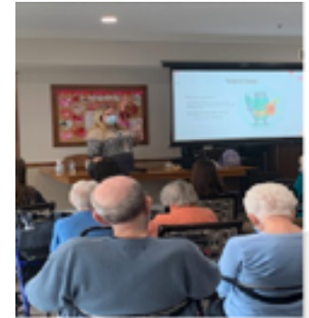
Halton IPAC HUB