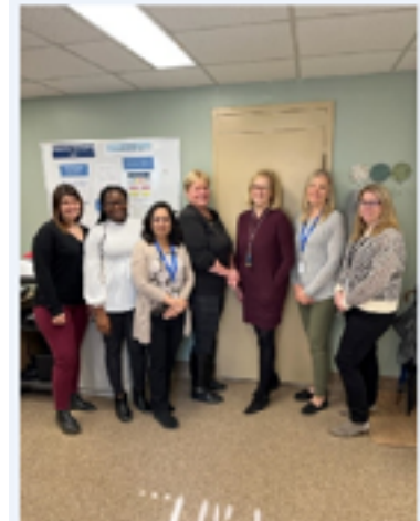
St. Joseph's Healthcare