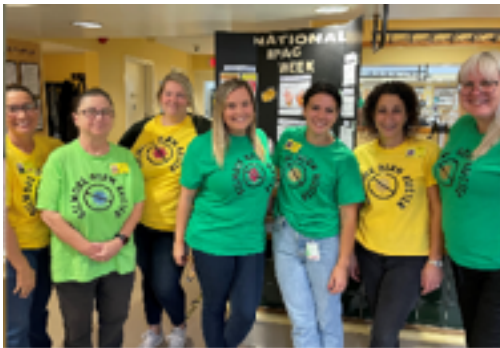
Niagara Region's first IPAC Awareness week In their 8 LTC homes