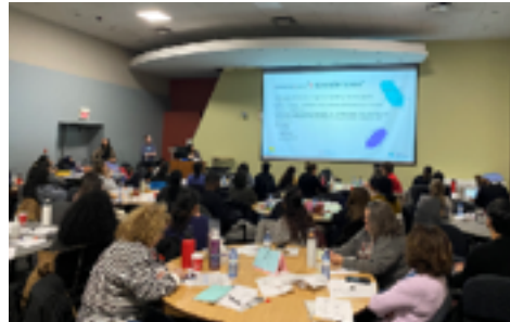
Trillium Health Partners